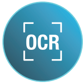
Optical Character Recognition

Higher Duty Cycles and Periodic Maintenance Intervals provide greater volume with fewer routine service calls so you can stay focused on productivity.